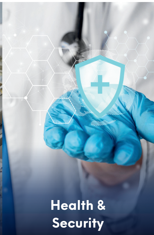
Health & Security