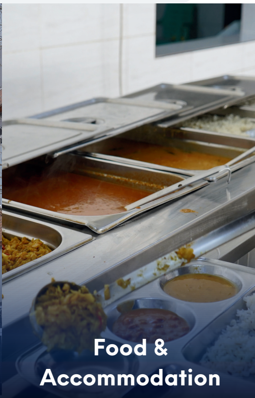
Food & Accommodation