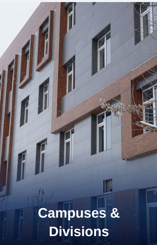
Campuses & Divisions

mountains. The information on academic performance and attendance of students is made available on the school's website each semester to make sure the training process is transparent. IHSM provides accommodation in hostels with modern facilities. Hostels have access to internet services and students are protected by special Security agencies